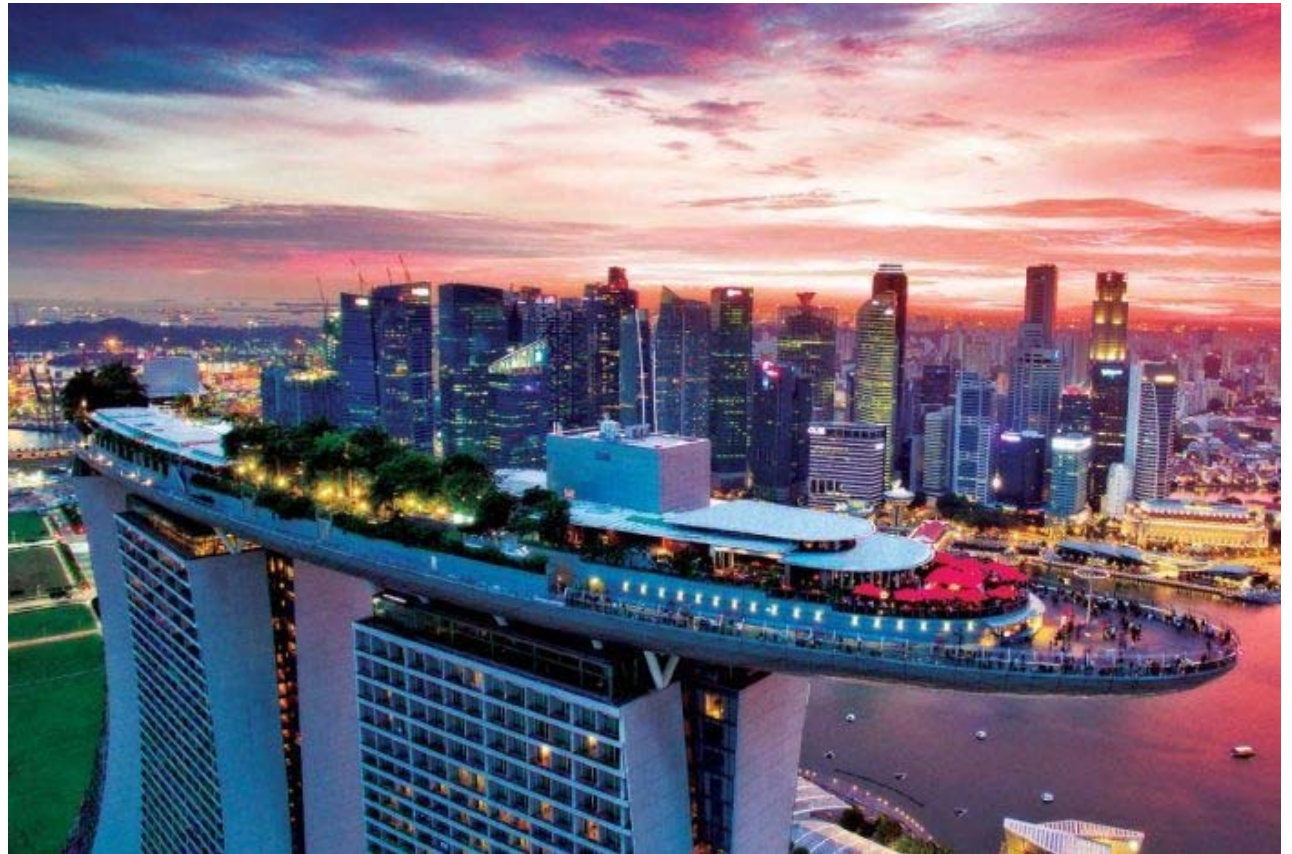
Marina bay sand